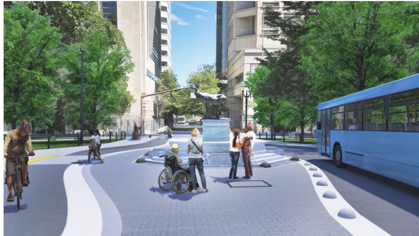
Proposed street improvements SW Main looking east

Based on 30-percent schematic design, the cost for the fountain restoration, new pump mechanism and reinstallation is estimated to be $1.2- $1.3 million. The street improvements would add approximately $670,000.